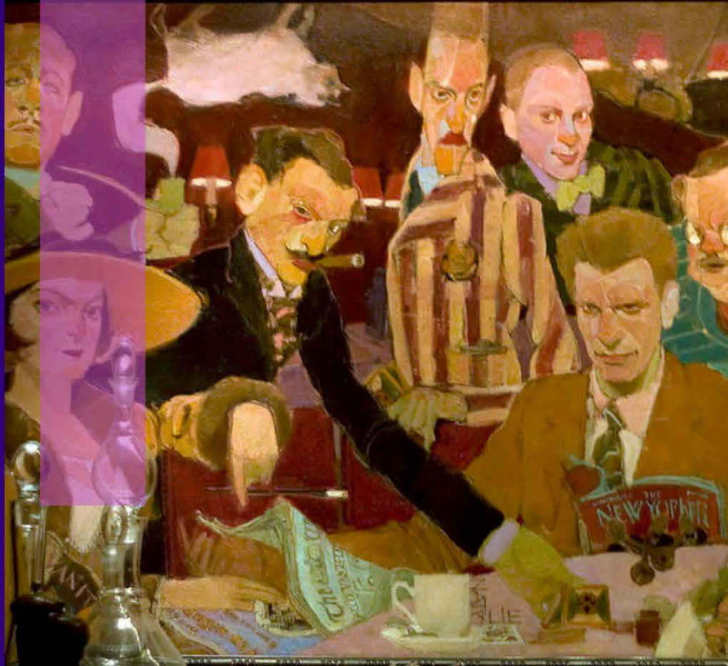
Dorothy Parker and the Algonquin Table

Leaders see the value of colleagues discussing trends, ideas, business ventures, and challenges. Some of the greatest minds of our time were part mastermind groups. Dorothy Parker and the Algonquin Round Table, Franklin Roosevelt and the Brain Trust, Martin Luther King Jr. and the Southern Christian Leadership Conference, and Thomas Edison and the Vagabonds, to name a few.